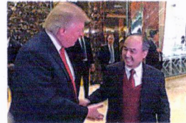
Trump welcomes Son's pledge to invest $50 bn in US