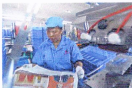
Trump signals the end of 'Made In China'