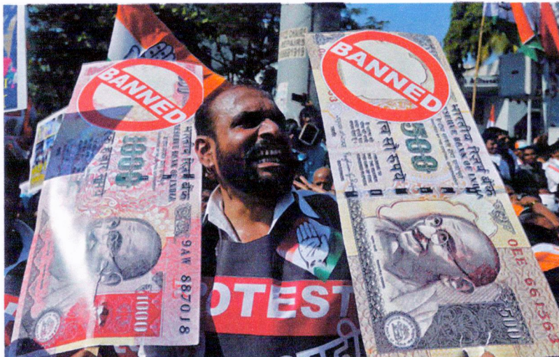
A man holds placards and shouts slogans during a rally organized by India's main opposition Congress party against the government's decision to withdraw 500 and 1000 Indian rupee banknotes from circulation in Mumbai on Nov. 28.

Modi's war on black money has hit India's economy. Is the price worth paying?