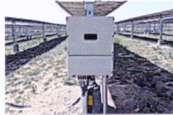
Huawei courses through Japan's power conditioner market