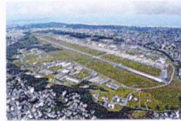
Time for Japan to reconsider the price of security