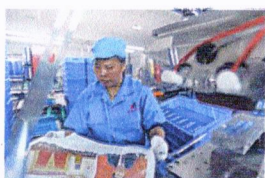
Trump signals the end of 'Made in China'