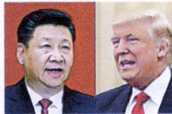
China up close: Xi Jinping moves to appease Donald Trump