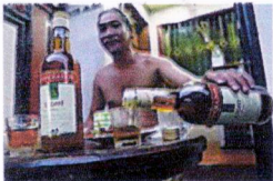
Philippines' Emperor dives into Latin American liquor market