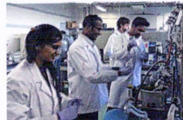
Japan to offer 1-year path to permanent residency