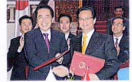
Vietnam teaches Japan a lesson