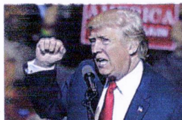
Trump scrambles to forge business ties