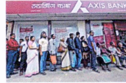
India's e-payment services boom on bank note ban