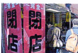
Japan's consumers are still in a funk

You have 4 FREE ARTICLES left this month.