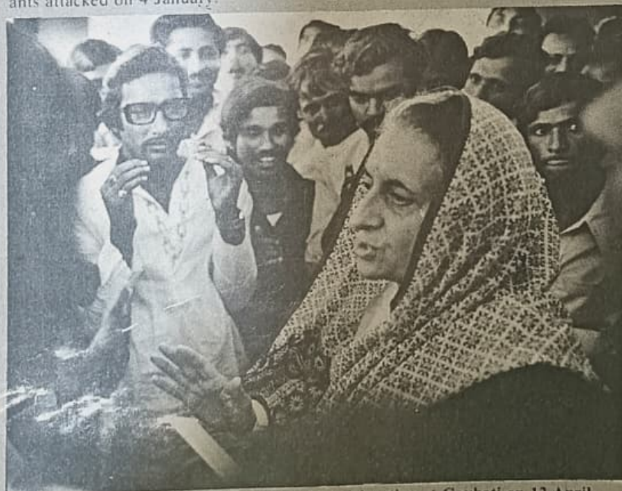
Mrs Gandhi being petitioned by a minorities delegation at Gauhati on 12 April.