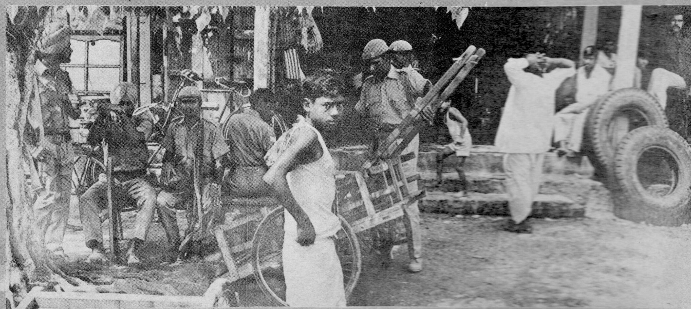
CRP men on guard a Hawli town in Barpeta subdivision.